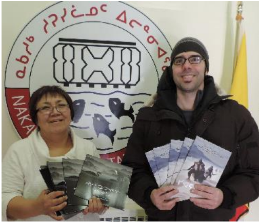
New Book Donations for Us!