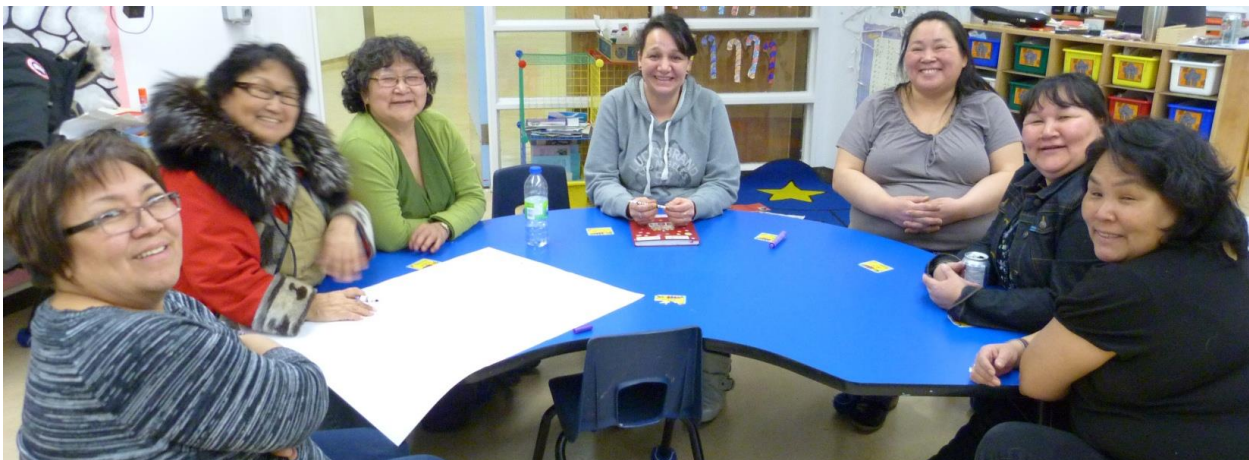
ᐃᓄᐅᓂᑦ ᐅᖃᐅᓯᑦᑕᓂᓂᓂᑦ ᓆᓂᓴᓄᓯᑦ Inuktitut Literacy Committee Members

The attached photos are from some of the activities that took place during the week.